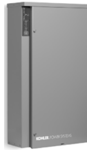
200 Amp with optional status indicator shown.